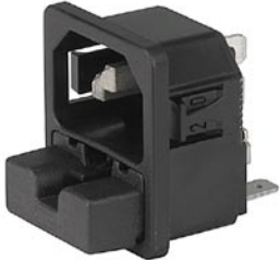
6220 IEC Appliance Inlet C14 with Fuseholder 2-pole