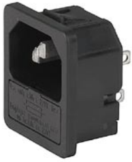
6200 IEC Appliance Inlet C14 with Fuseholder 1-pole